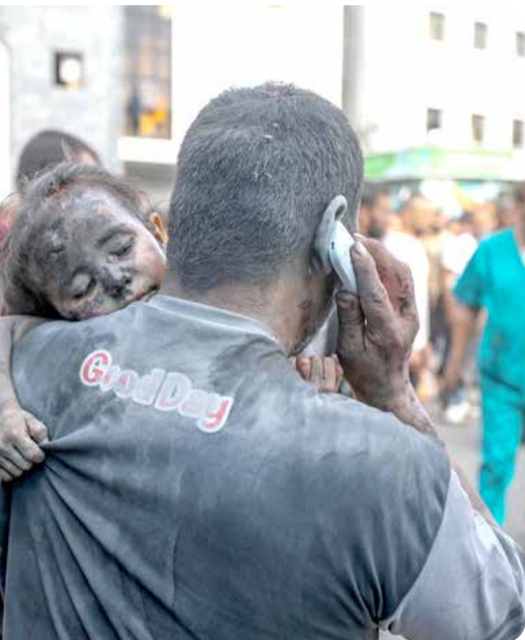
Rescues an injured baby girl into the Al-Shifa hospital in Gaza City

The Bosphorus Bridge in Istanbul, Turkey is completed, connecting the continents of Europe and Asia over the Bosphorus for the first time