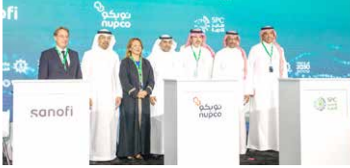
The deal signing

The agreement was made in partnership with the Local Content and Government Procurement Authority, the the Expenditure and Project Efficiency Authority, known as Expro. It activated the contracting method to localize the industry and transfer knowledge. This method contributes