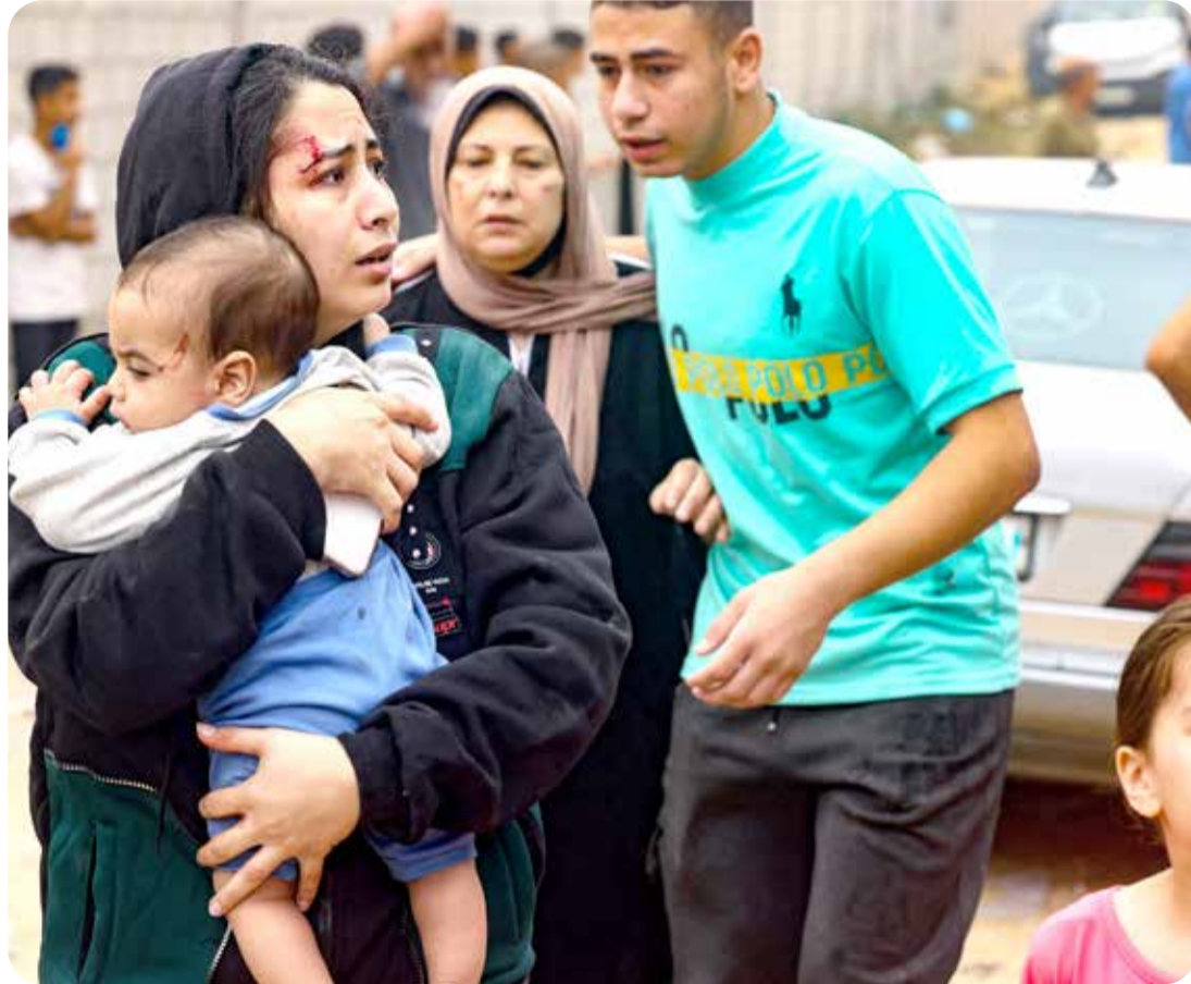
An injured woman carries a baby in the aftermath of Israeli bombing in Rafah in the southern Gaza Strip

Jehovah's Witnesses are members of a US-based Christian evangelical movement, and are perhaps best known for knocking on doors around the world, bible in hand, trying to convert people to their beliefs.