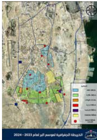
Digital camping map

In an effort to encourage friendly competition and showcase the best camps, HH Shaikh Nasser has given the green light for a thrilling camping compe-