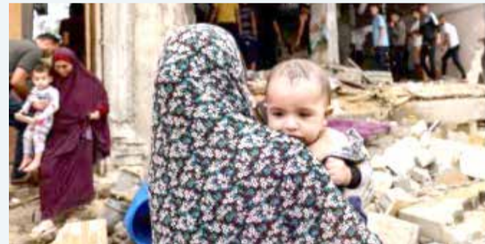
Women carry children as others check the damage in the aftermath of Israeli bombing in Rafah

"International law stipulates that it (the reaction) must be proportionate. Civilians must be taken into account, and humanitarian law is very clear on this. I think this limit has been largely exceeded," Prime Minister Jonas Gahr Store said on NRK public