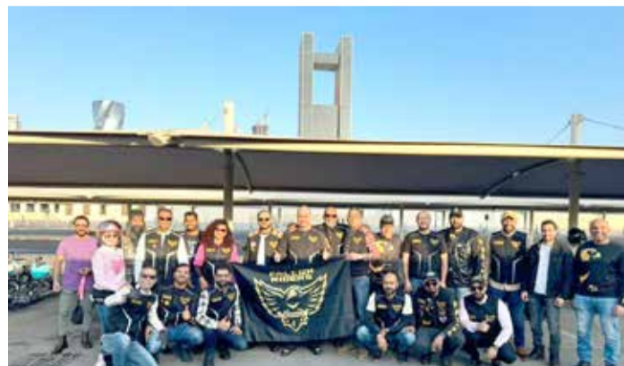
In pictures, bikers during the THINKPINK 2023 Ride event

This engaging two-hour event kicked off at the Avenues Mall in the morning, with more than