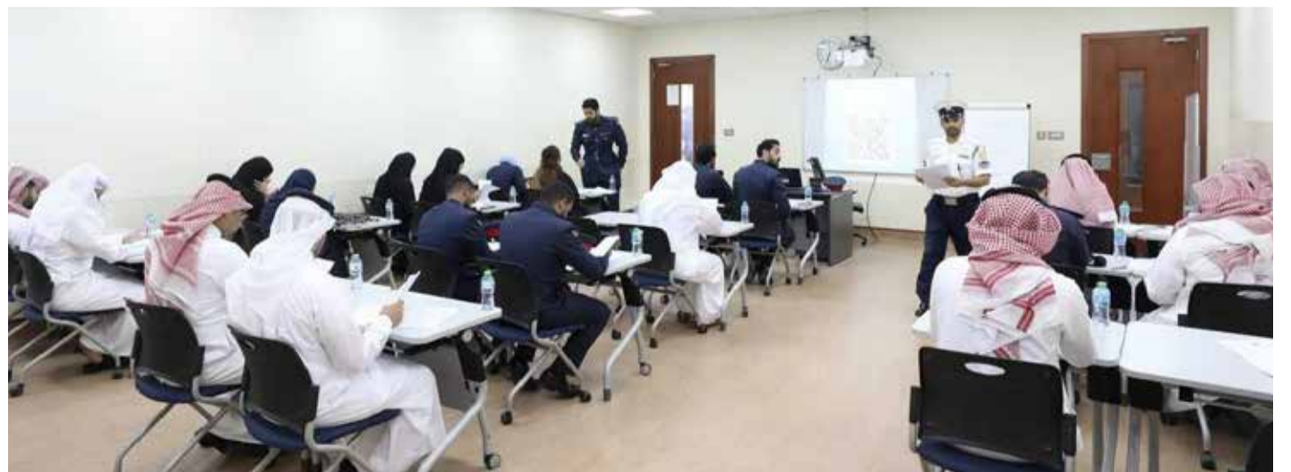
The Royal Academy of Police (RAP) has held an orientation day for 102 new master's degree students in general law, police science and criminal science. RAP Commander Brigadier Fawaz Al Hassan expressed thanks and appreciation for the wise instructions of His Excellency Interior Minister to provide the required services to enhance the skills of the workforce. Al Hassan pointed out that the admission tests were based on measuring the skill proficiency of applicants to ensure their capabilities fulfil the requirements of the higher education programmes. He congratulated the new students and wished them all the best.