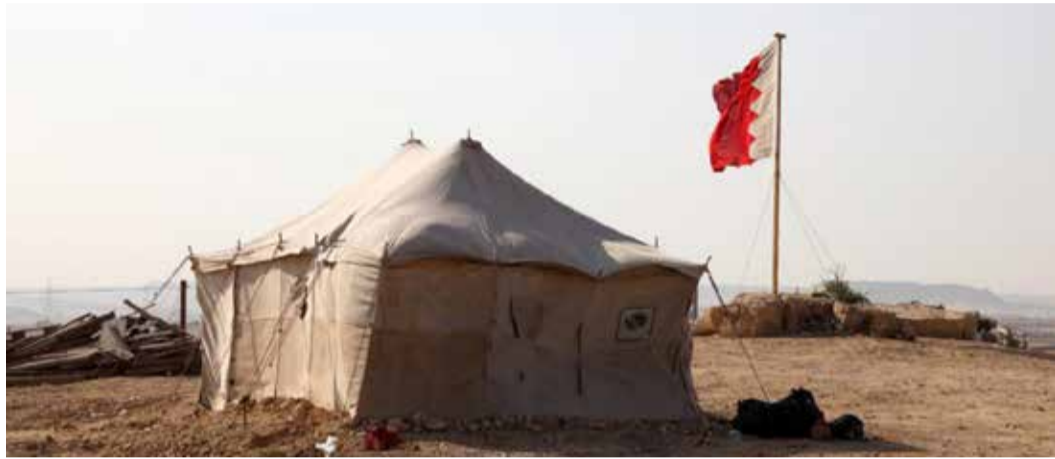
Camping season will be more enjoyable than ever before