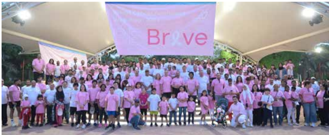
Participants during a group photo opportunity