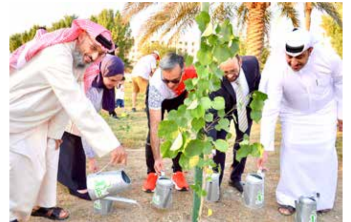
Planting a tree as part of 'Forever Green' campaign