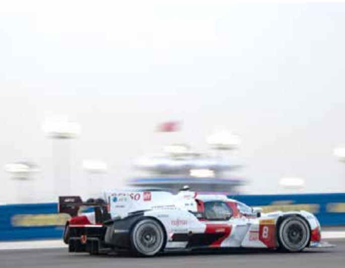
Toyota Gazoo Racing's #8 car in action at last year's WEC race weekend

"The Home of Motorsport in the Middle East" is all geared up to welcome the world's top endurance racing teams and their star-studded cast of drivers, who will be battling it out in some of the most iconic and