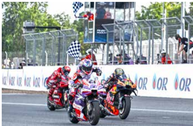
Jorge Martin (centre) celebrates as he crosses the finish line ahead of Brad Binder (right) and Francesco Bagnaia