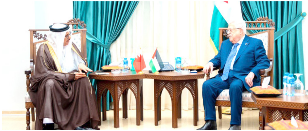
Dr Al Zayani and President Abbas hold talks

Dr Al Zayani was speaking as he met Mahmoud Abbas, President of the State of Palestine,