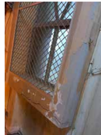
ed cracks in walls and foundations, emphasising the repeated

objections from worshippers regarding the authorities' indifference.