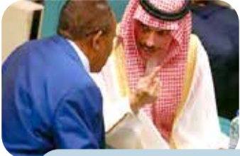
Saudi says Sudan talks to focus on ceasefire and aid

◆ Negotiations in Jeddah between Sudan's warring parties will focus on a ceasefire deal and the delivery of humanitarian aid but not on broader political issues, Saudi Arabia said yesterday. The talks, which resumed on Thursday, aim "to facilitate the delivery of humanitarian assistance, establish ceasefires and other confidence building measures, and build toward a permanent cessation of hostilities," a foreign ministry statement said. "The talks will not address broader political issues," it added. Since April, the war in Sudan between regular forces loyal to army chief Abdel Fattah al-Burhan and the paramilitary Rapid Support Forces (RSF) commanded by his former deputy Mohamed Hamdan Daglo has killed more than 9,000 people and displaced upwards of 5.6 million.