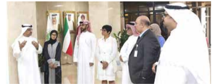
Visitors learn more about Bahrain's rich heritage and civilisation