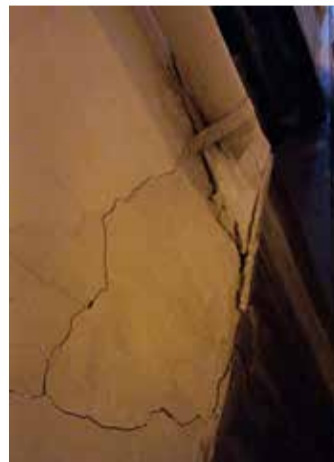
Cracks in walls and foundations and on the brink of collapse