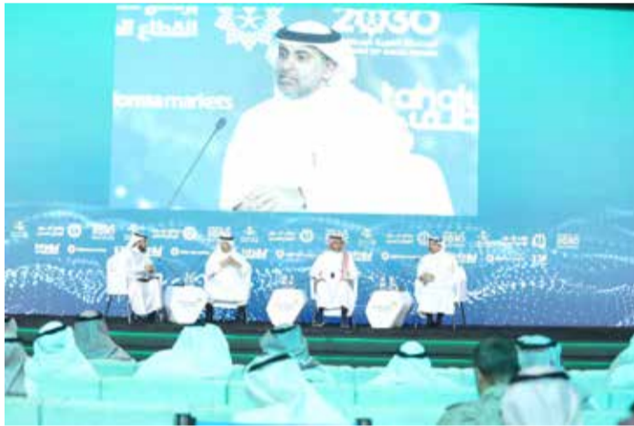
A panel discussion at the expo

The panel discussion brought together Minister of Health Fahd Al-Jalajel, Minister of Investment Engineer Khaled