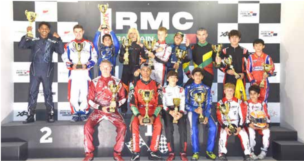
Winners from the last two rounds