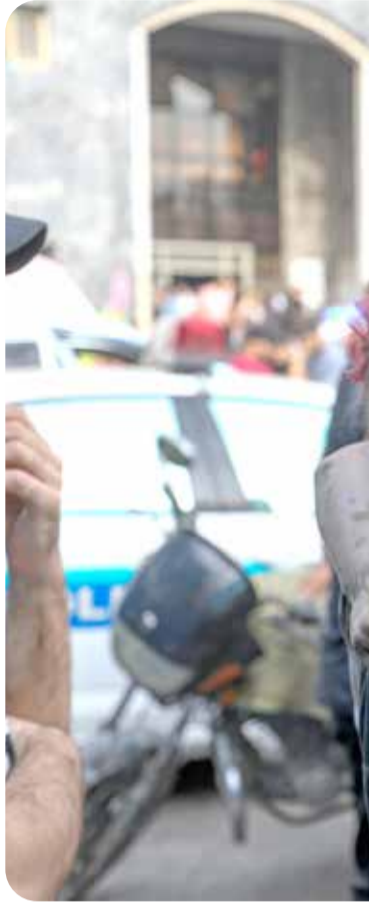
A Palestinian man covered with dust carries a child in the aftermath of Israeli bombing in Rafah in the southern Gaza Strip