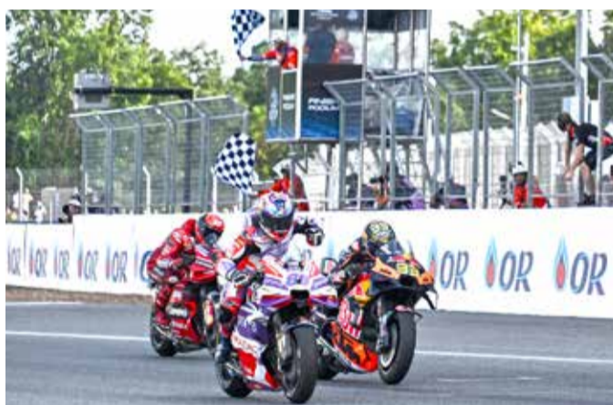
Jorge Martin (centre) celebrates as he crosses the finish line ahead of Brad Binder (right) and Francesco Bagnaia