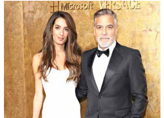
George and Amal Clooney