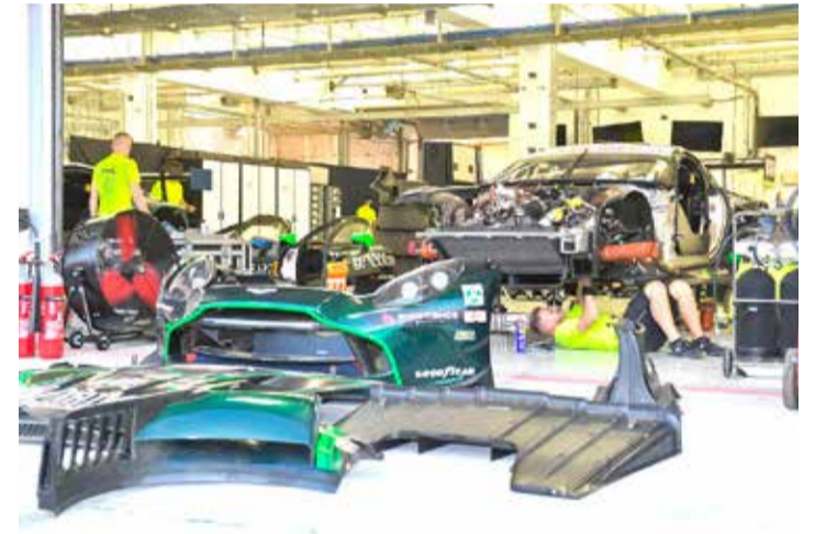
Crew members work on the cars ahead of the race

Meanwhile, the LMGT3 category will be making its debut runs at BIC. Having replaced the