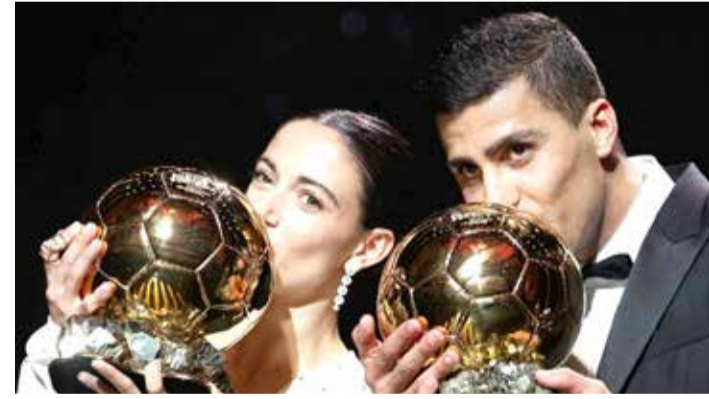
Barcelona's Spanish midfielder Aitana Bonmati (L) and Manchester City's Spanish midfielder Rodri pose with their Ballon d'Or award

Rodri was diplomatic when addressing the question of Real's no-show in his post-award press conference.