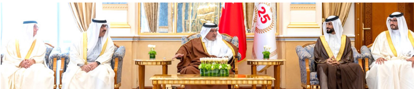
His Royal Highness Prince Salman bin Hamad Al Khalifa, the Crown Prince and Prime Minister, met yesterday with the Minister of Education, Chairman of the Supreme Organising Committee for the International School Games (ISF) Gymnasiade Bahrain 2024, His Excellency Dr. Mohammed bin Mubarak Juma, and the members of the Executive Organising Committee for the ISF Gymnasiade Bahrain 2024, at Gudaibiya Palace. The International School Games (ISF) Gymnasiade Bahrain 2024 is being hosted by the Kingdom of Bahrain under the patronage of His Majesty King Hamad bin Isa Al Khalifa. HRH Prince Salman noted that the Kingdom continues to adopt initiatives that strengthen its capabilities to host international competitions, in line with the far-reaching vision of HM the King.