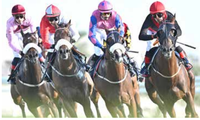
Action from a race at REHC

His Highness Shaikh Isa bin Salman bin Hamad Al Khalifa, Chairman of the Board of Trustees of the Isa bin Salman Education Charitable Trust, Chairman of the Board of Directors of the Labour Fund