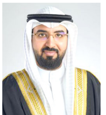
MP Hassan Ebrahim

Al Buainain also highlighted that 28 roles, which do not re-