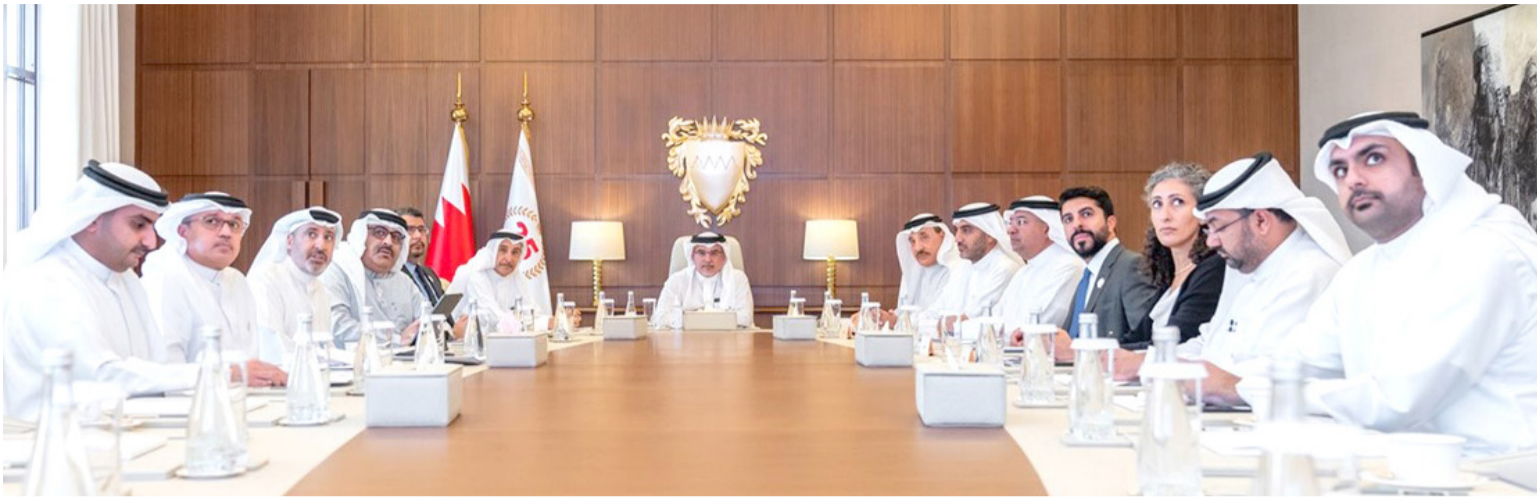
His Royal Highness Prince Salman bin Hamad Al Khalifa, the Crown Prince and Prime Minister, chaired the 28th meeting of the Civil Service Council. During the meeting, the Council reviewed a comprehensive report on human resources within the government sector and discussed a proposal to restructure several government agencies. The restructuring aims to enhance performance and boost operational efficiency across the public sector.