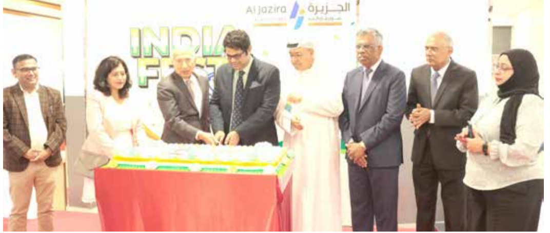
Inauguration of India Festival at Al Jazira Zinj Supermarket