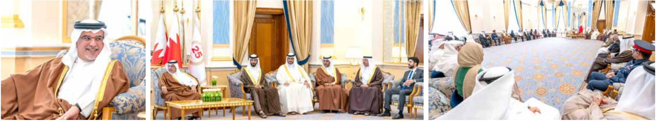
His Royal Highness the Crown Prince and Prime Minister Salman bin Hamad Al Khalifa meets with the Chairman and members of the Supreme Organising Committee, and members of the Executive Organising Committee for the International School Games (ISF) Gymnasiade Bahrain 2024, and commends the event's outstanding organisational efforts