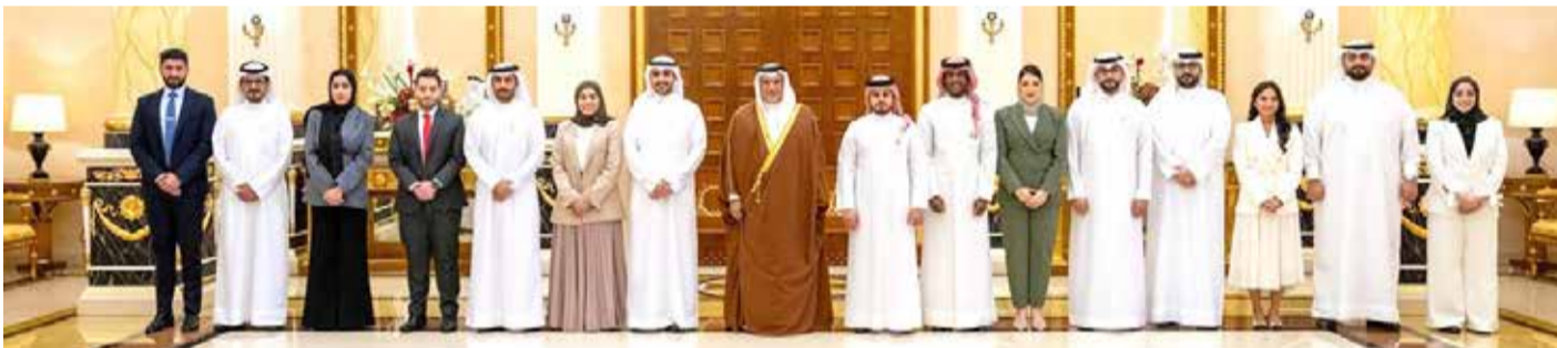
HRH Prince Salman with members of the PM Fellowship Program 10th intake

HRH Prince Salman: Upskilling workforce aligns with Bahrain's development goals