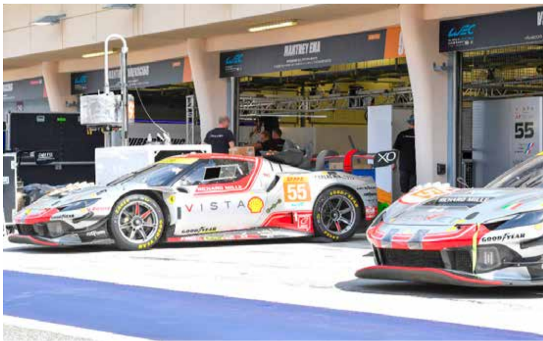
Cars are seen at the pit lane at BIC

Headlining the cast of WEC, Formula 1, and other FIA series World Champions are former F1 World Champion Jenson Button, MotoGP legend Valentino Rossi, grand prix-winner Robert Kubica, and other popular drivers including Mick Schumacher, Sebastian Buemi, Kamui Kobayashi, Antonio Giovinazzi, Daniil Kvyat, Mike Conway, and Paul Di