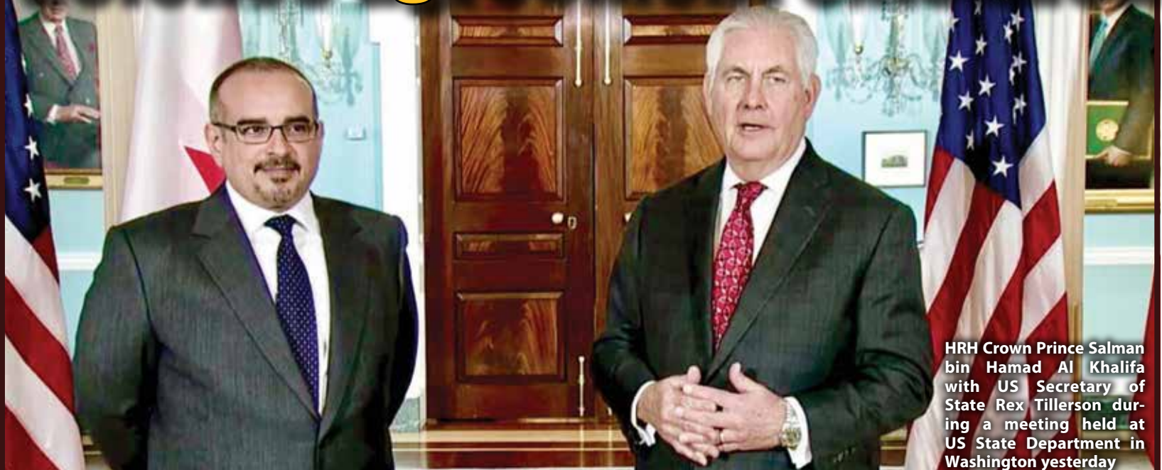
HRH Crown Prince Salman bin Hamad Al Khalifa with US Secretary of State Rex Tillerson during a meeting held at US State Department in Washington yesterday