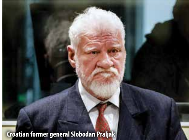
Croatian former general Slobodan Praljak

The hearing was then quickly suspended as Praljak's lawyer shouted out: "My client says he has taken poison."