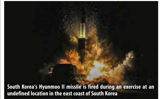
South Korea's Hyunmoo II missile is fired during an exercise at an undefined location in the east coast of South Korea