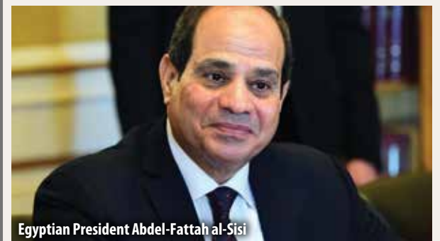
Egyptian President Abdel-Fattah al-Sisi