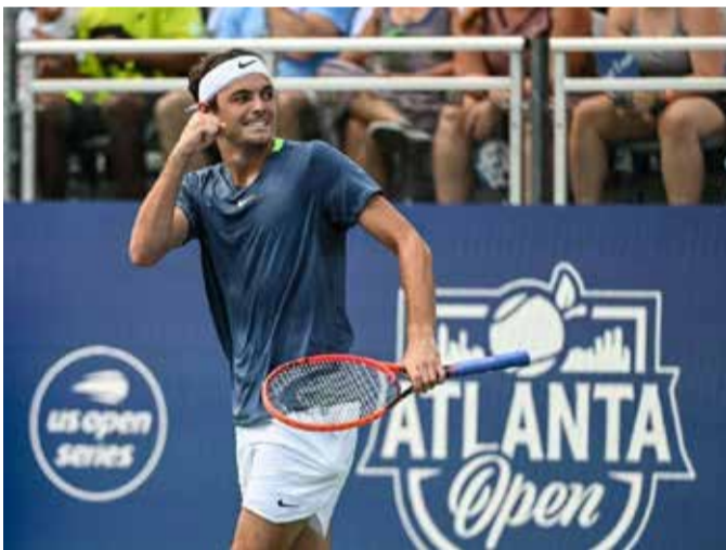
Taylor Fritz celebrates after a shot against J.J. Wolf