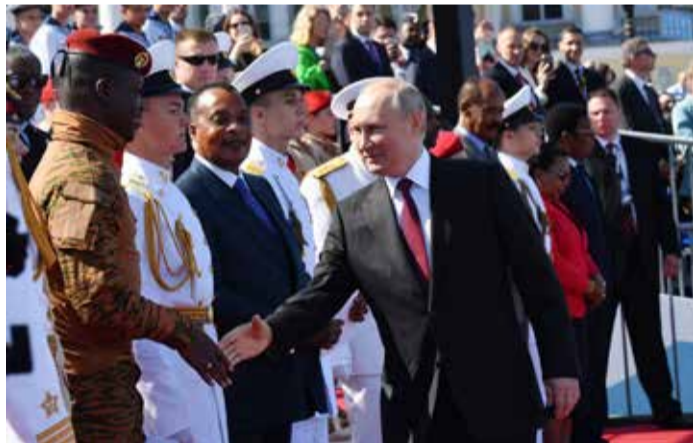
Russian President Vladimir Putin and several African leaders attend the Navy Day parade in Saint Petersburg

"In the name of Russia, our sailors give all their strength,