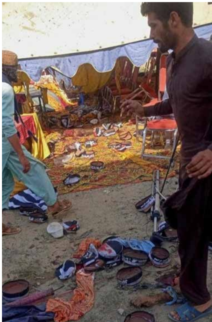
Men gather at the site of a bomb blast in Bajaur district on July 30, 2023. At least 16 people were killed and dozens more wounded on July 30 by a bomb blast at a political gathering of a radical Islamic party in northern Pakistan, police said

local chapter of the Islamic State (IS) group has recently carried out attacks against JUI-F.