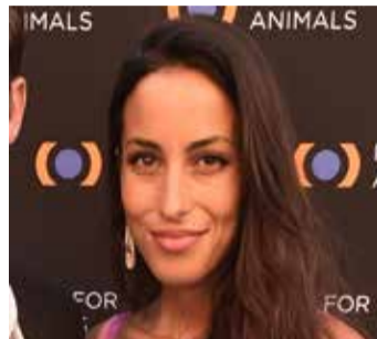
Ines de Ramon

a Hollywood restaurant, both in December. "They were very cute and flirty. You could tell that she makes him happy," a source told People at the time.