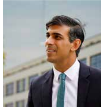
Britain's Prime Minister Rishi Sunak

"I think it makes absolutely no sense, as the Labour Party