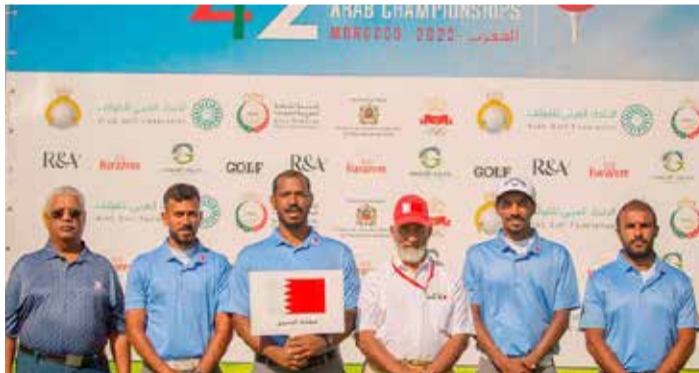
Bahrain national team players and officials at the tournament

He carded a three-over-par total of 219 to finish just eight