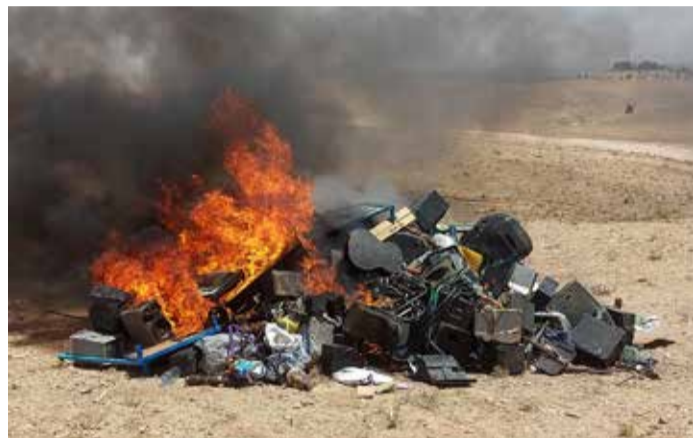
A pile of musical instruments and equipments being set on fire by the members of Taliban on the outskirts of Herat.

Saturday's bonfire saw hundreds of dollars worth of musical gear go up in smoke -- much of it collected from wedding halls in the city.