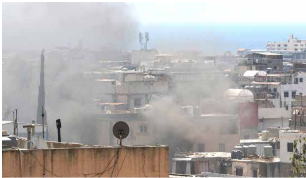
Smoke billows during clashes inside the Ain al-Helweh Palestinian refugee camp yesterday.

The statement denounced an "abominable and cowardly crime" aimed at undermining