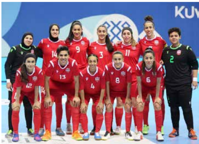
Bahrain's women's futsal team

Championship 2023 is scheduled for 3 to 9 September at the Terminal 21 Shopping Centre in Nakhon Ratchasima Province.