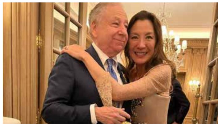
Michelle Yeoh and Jean Todt

Michelle - who is Buddhist - previously cited her inability to have children as the reason for ending her first marriage to Dickson Poon, the owner of