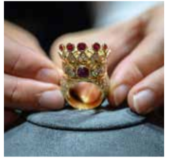
The gold, diamond and ruby ring worn by rapper Tupac Shakur in his last public appearance

The New York-born Shakur wore the ring during his final public appearance