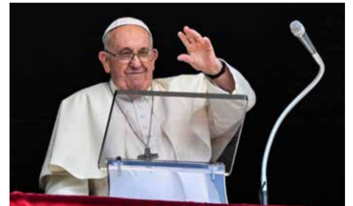
Pope Francis waves from the window of the apostolic palace overlooking St. Peter's square during the weekly Angelus prayer yesterday in The Vatican.