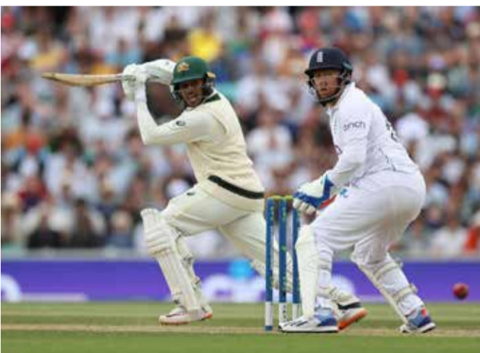
Usman Khawaja of Australia bats as Jonny Bairstow of England keeps wicket

If Australia do manage to reach that target, it will be the