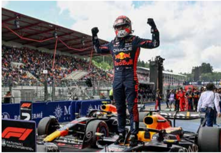
Red Bull Racing's Dutch driver Max Verstappen celebrates in the parc ferme

It was Red Bull's record-extending 13th win in succession,