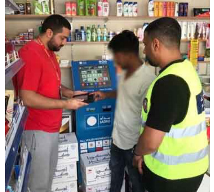
An expat's status is being checked