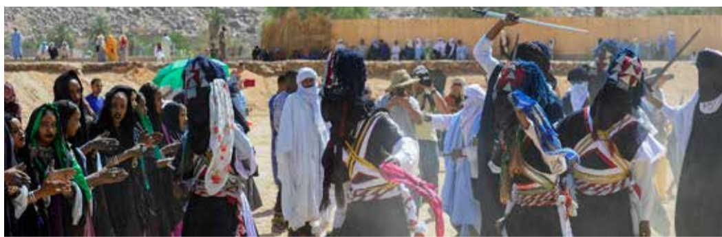
Men and women perform a traditional dance during the Sebeiba Festival.

The annual Sebeiba festival, held in Djanet, 1,500 kilometres