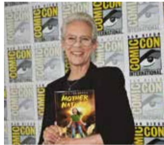
Jamie Lee Curtis

She described her original idea for the environmental nov-