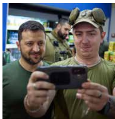
President Volodymyr Zelenskyy (L) posing for a picture with a serviceman during his visit in Donetsk region.

The attack damaged two office towers and briefly shut an international airport.