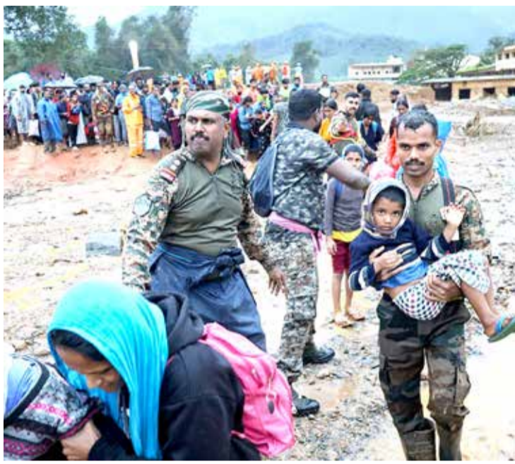
Indian Army, security and relief personnel rescue victims