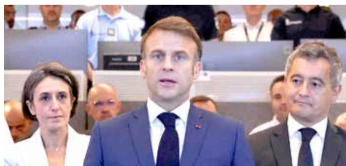
France's President Emmanuel Macron

The United Nations, which considers Western Sahara a "non-self-governing territory", has had a peacekeeping mission there since 1991 whose stated