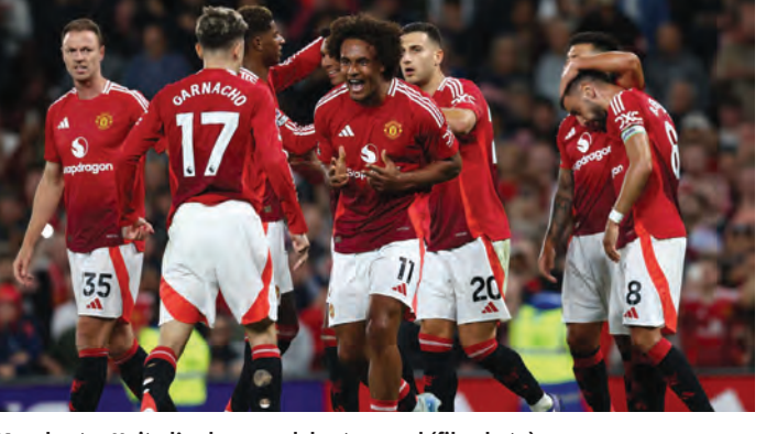
Manchester United's players celebrate a goal (file photo)

at home to 2022 Europa League of Mourinho's old sides.