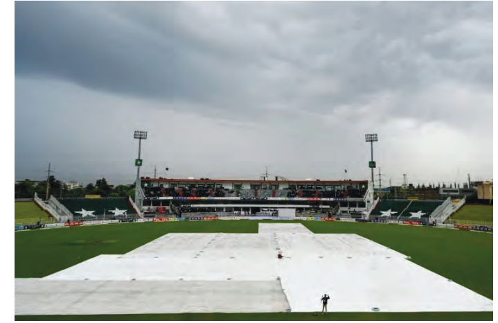
Hosts Pakistan are desperate Dark clouds loom over Rawalpindi Cricket Stadium

"The first day's play has been called off due to persistent rain and wet outfield," Pakistan Cricket Board said. Neither team left their hotels.