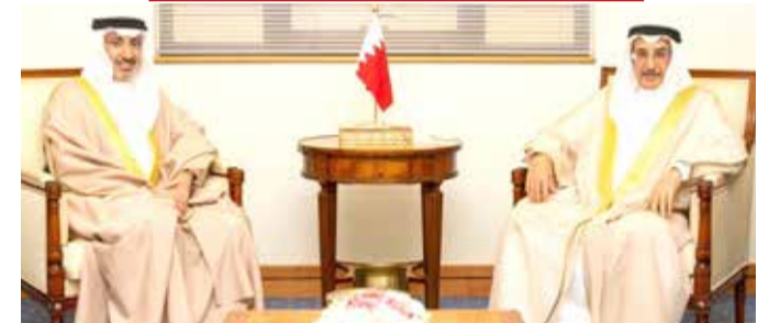
H.E. Shaikh Khalid bin Abdullah Al Khalifa, Deputy Prime Minister, received H.E. Shaikh Daij bin Salman bin Daij Al Khalifa, President of the Civil Service Bureau (CSB). The Deputy Prime Minister affirmed the importance of continuing to develop national government capacities by providing the civil service sector with initiatives aimed at raising productivity and improving performance in line with the comprehensive development process led by His Majesty King Hamad bin Isa Al Khalifa, and the follow-up of His Royal Highness Prince Salman bin Hamad Al Khalifa, the Crown Prince and Prime Minister. He congratulated the CSB President on obtaining the royal trust, wishing him success in performing his tasks.