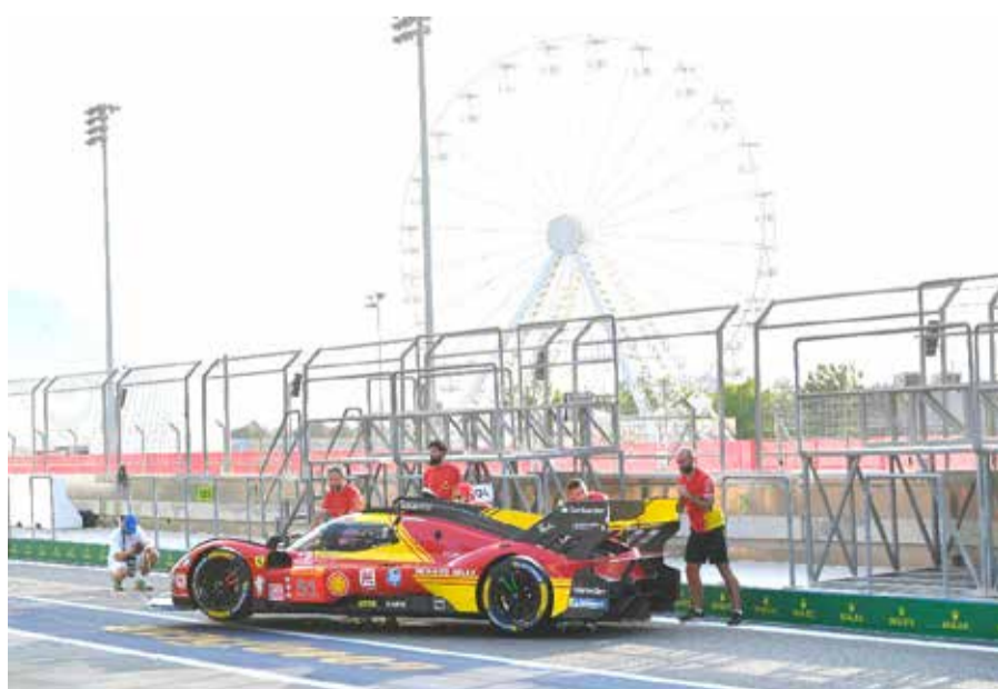
Crew members work on a car on the track at BIC

All those attending will similarly be able to interact with BIC's army of roaming performers, including jugglers, stilt-walkers, face painters, street drummers, balloon mime acts, and musicians.