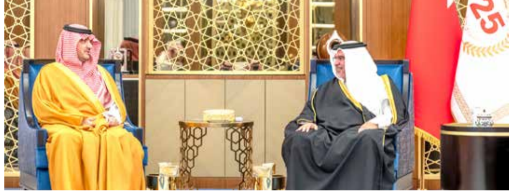
His Royal Highness Prince Salman bin Hamad Al Khalifa, the Crown Prince and Prime Minister, meets with His Royal Highness Prince Abdulaziz bin Saud bin Nayef bin Abdulaziz Al Saud, Minister of Interior of the Kingdom of Saudi Arabia.