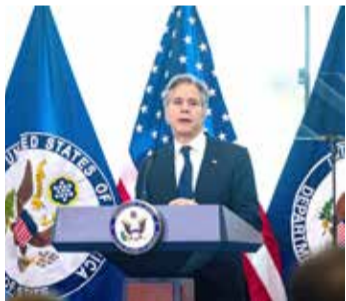
US Secretary of State Antony Blinken

With President Joe Biden's four-year term almost over, the fates of dozens of ambassadors and other senior national security positions remain pending in the Senate, mostly due to political fights with the rival Republican Party.