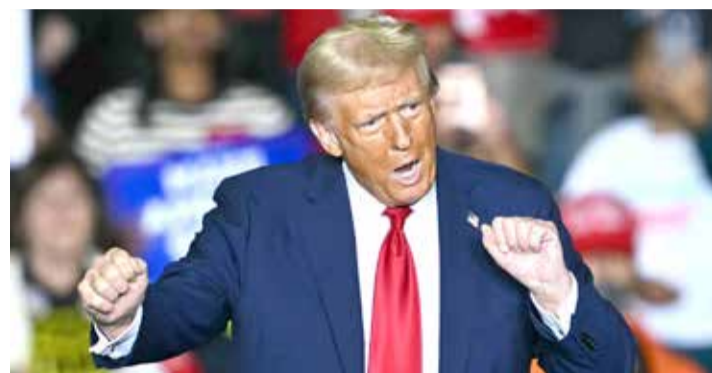
Former US President and Republican presidential candidate Donald Trump dances onstage

"But let me be clear, I strongly disagree with any criticism of