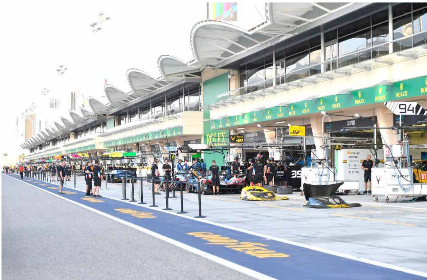
Crews work on cars ahead of the race weekend

All tickets sold will help make a positive environmental impact in the Kingdom, as BIC and Bapco Energies have brought