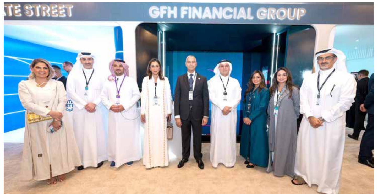
Officials during the launch

At Future Investment Initiative gathering of global investors and business leaders