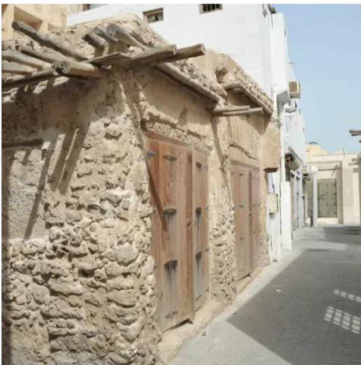
A historic building in Muharraq with a unique architectural identity

The authority has stressed the importance of "preserving the building's unique outward features" to protect Muharraq's architectural character.