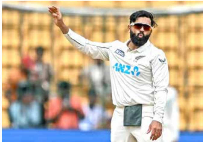
New Zealand's Ajaz Patel in action (file photo)