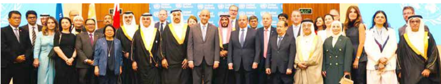
Ambassadors and other dignitaries into force in 1945.

The celebration, held at the Diplomat Radisson Blu Hotel, marked the anniversary of the United Nations Charter's entry