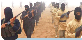
American strikes killed up to 35 jihadists in Syria: US military

American air strikes killed up to 35 Islamic State group members in Syria earlier this week, the US military said yesterday. It is the latest in a series of operations in recent months by US and local forces in Iraq and Syria against the jihadists, who once held swathes of territory in both countries. "The strikes targeted multiple ISIS locations in the Syrian desert, targeting multiple ISIS senior leaders," US Central Command (CENTCOM) said on social media, using an acronym for the Islamic State (IS) group. There are no indications of civilian casualties from the strikes, which were carried out on October 28, CENTCOM said. "The air strikes will disrupt the ability of ISIS to plan, organize and conduct attacks against civilians as well as US allies and partners throughout the region and beyond," it added. US and Iraqi forces conducted a joint raid last week that Baghdad said left nine jihadists dead, among them the top IS leader in the country, while CENTCOM announced on October 18 that Iraqi strikes had killed a senior leader from the group along with three other militants.