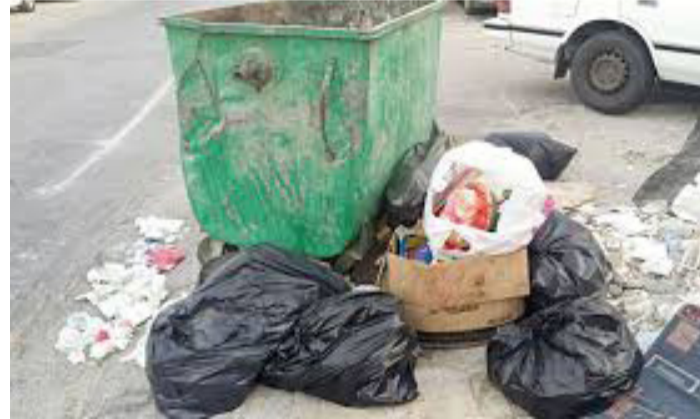
The Northern Governorate is currently facing a problem due to a lack of sufficient waste containers

She further emphasized that the Northern Governorate currently lacks sufficient waste