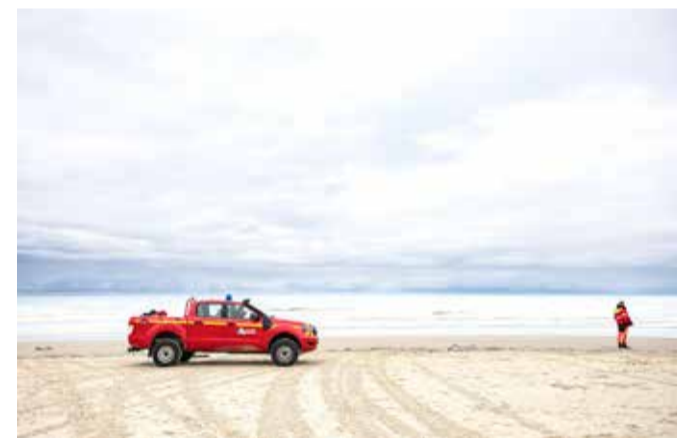
Rescuers monitor the sea as migrants were being rescued following a failed attempt to cross the English Channel near Neufchâtel-Hardelot, northern France