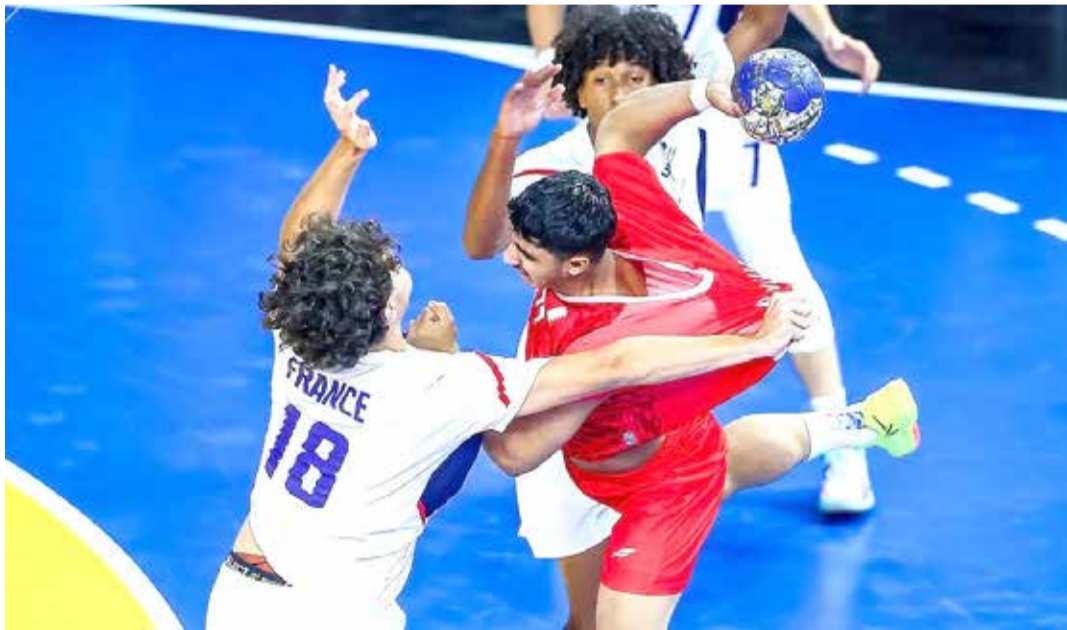
Action from Bahrain's handball match against France