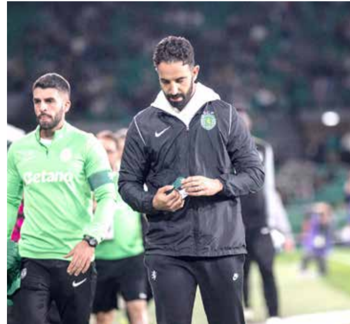
Sporting's coach Ruben Amorim arrives prior to a match

The 39-year-old though was guarded when asked after Sporting's League Cup win against Nacional on Tuesday if that was his last match with the