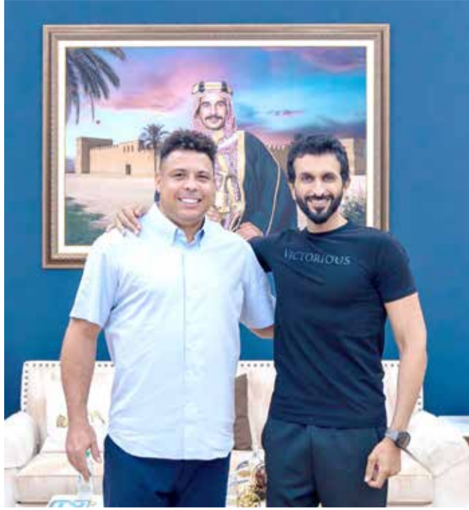
His Highness Shaikh Nasser bin Hamad Al Khalifa, His Majesty the King's Representative for Humanitarian Work and Youth Affairs and Chairman of the Supreme Council for Youth and Sport receives Former Brazil International footballer Ronaldo