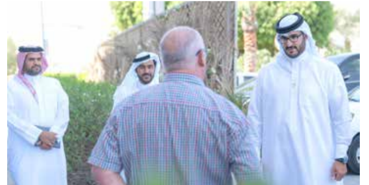
HH Shaikh Isa bin Salman bin Hamad Al Khalifa during his visit to REHC