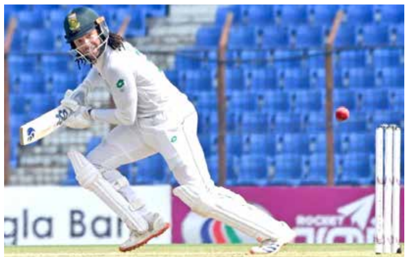
South Africa's Tony De Zorzi plays a shot

Senuran Muthusamy was unbeaten at the declaration for 68 off 75 balls with five fours and two sixes, his Test best.