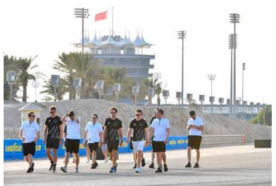
Team members inspect the track at BIC

The WEC 8 Hours of Bahrain will feature an Open Paddock experience, allowing fans to go behind the scenes and meet top drivers, including Formula 1 and MotoGP legends, amidst a fun-filled weekend of racing and entertainment