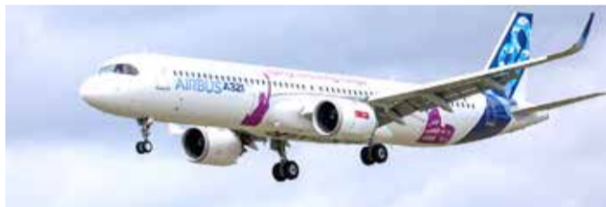
Representative picture Riyadh, Saudi Arabia

Saudi Arabia’s new national airline, Riyadh Air, announced yesterday it has ordered 60 narrow-body aircraft from Airbus, as it prepares for takeoff next year.