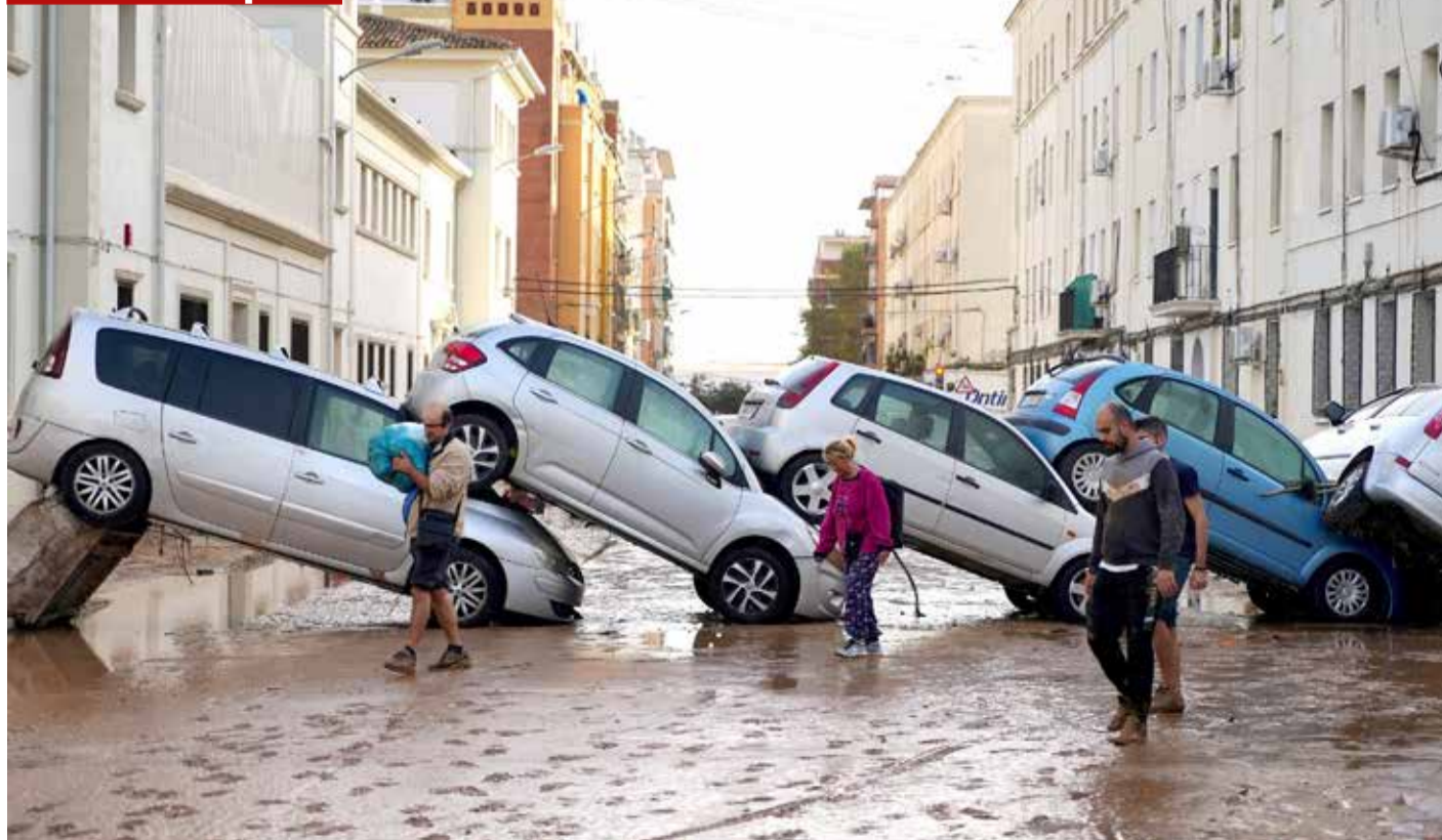
Residents walk past piled up cars following deadly floods in Sedavi, south of Valencia, eastern Spain, on October 30, 2024. Floods triggered by torrential rains in Spain's eastern Valencia region has left at least 70 people dead, rescue services said