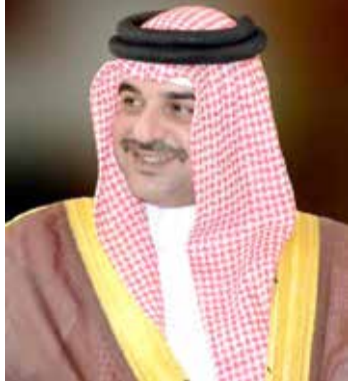
His Highness Shaikh Abdulla bin Hamad Al Khalifa

Bahrain International Airshow is held under the esteemed patronage of His Majesty King Hamad bin Isa Al Khalifa and His Royal Highness Prince Salman bin Hamad Al Khalifa, the Crown Prince and Prime Minister, and under the supervision of His Highness Shaikh Abdulla bin Hamad Al Khalifa, Personal Representative of His Majesty the King and Chairman of BIAS Supreme Organising Committee.