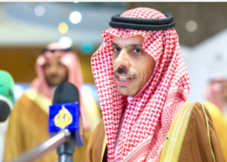
Saudi Foreign Minister Prince Faisal bin Farhan

Saudi Arabia on Wednesday hosted the first meeting of a new "international alliance" to press for the establishment of a Palestinian state. Unveiled last month on the sidelines of the UN General Assembly, the "International Alliance to Implement the Two-State Solution" brings together nations from the Middle East, Europe and beyond. Saudi Foreign Minister Prince Faisal bin Farhan said nearly 90 "states and international organisations" were taking part in the two-day meeting in Riyadh. "A genocide is happening with the goal of evicting the Palestinian people from their land, which Saudi Arabia rejects," he said, describing the humanitarian situation as "catastrophic" and denouncing the "complete blockade" of northern Gaza. The Riyadh meeting was expected to focus on humanitarian access, the embattled UN agency for Palestinian refugees and measures to advance a two-state solution, diplomats said. The European Union was set to be represented by Sven Koopmans, the special representative for the Middle East peace process, diplomats said. The United States sent Hady Amr, the State Department's special representative for Palestinian affairs.